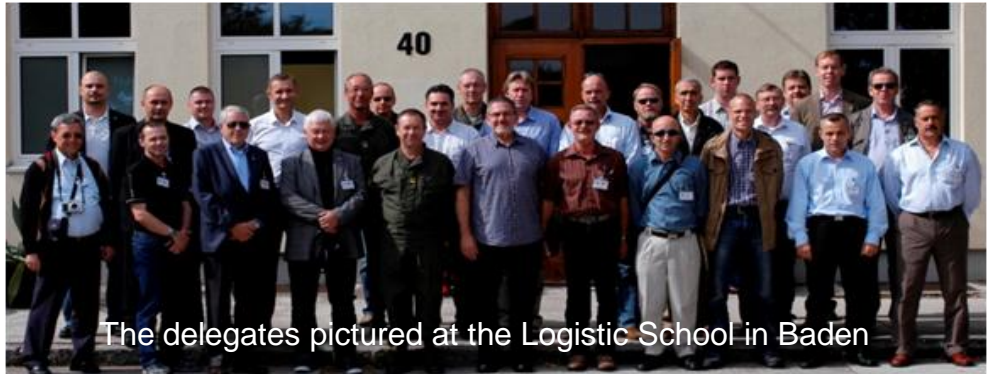
The delegates pictured at the Logistic School in Baden